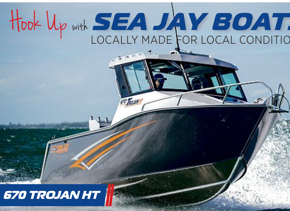
670 TROJAN HT

Hook Up with SEA JAY BOATS LOCALLY MADE FOR LOCAL CONDITIONS