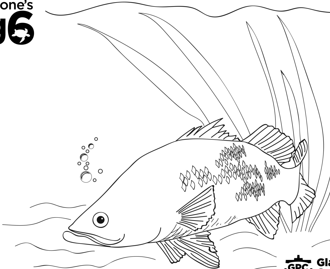
Barramundi (Lates calcarifer)